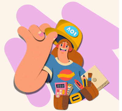
Testimonial from AOI Member

"I don't think I would have a career without the AOI. The confidence I have developed through learning how much to quote clients, the legal stuff of the business of being an illustrator and just general support I have received from them has been fundamental to my career. I joined when I was fresh out of university and I've now been full time freelance for over ten years - I would recommend for any illustrator new or more experienced to get involved with them!"